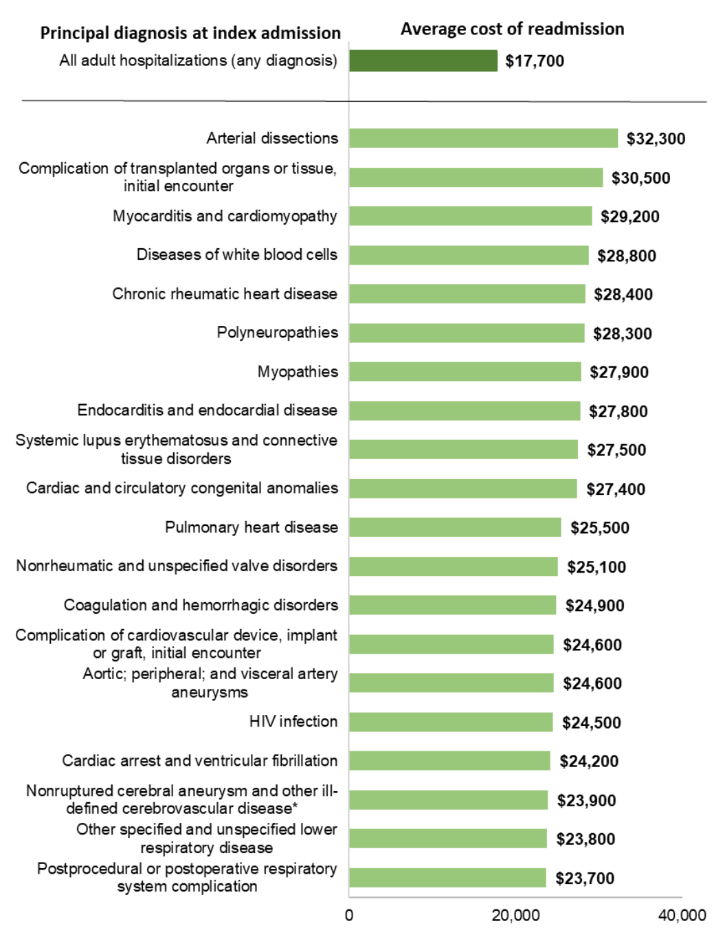
Figure 3. Top 20 principal diagnoses with the highest average cost of 30-day all-cause adult readmissions, 2020

Notes : Diagnoses are grouped using the Clinical Classifications Software Refined (CCSR) for ICD-10-CM Diagnoses. CCSR categories classified as "neoplasms" (cancer) or "factors influencing health status and contact with health services" (e.g., encounter for antineoplastic therapies) are excluded from reporting. A minimum volume threshold of 10,000 index admissions was required for a CCSR category to be reported. Average cost of readmission is rounded to the nearest $100. Costs reflect the actual expenses incurred in the production of hospital services.